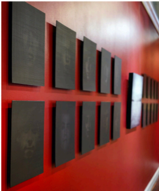
An installation view of Soomin Ham's "Lingering Glimpses" of American servicemen and -women killed in Iraq and Afghanistan, grouped in a somber memorial.